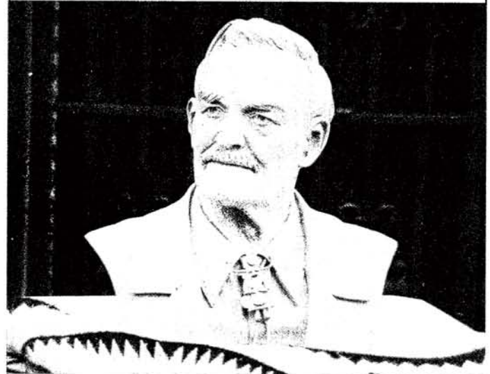
Limited Edition Bronze

For Information Contact The Milton H. Erickson Memorial Bronze Project